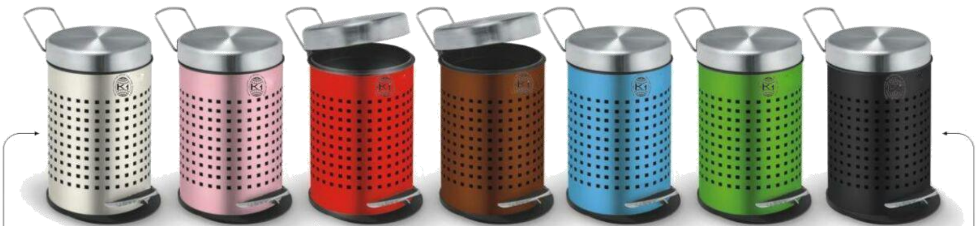
Off White Baby Pink Red Brown Blue Green Black