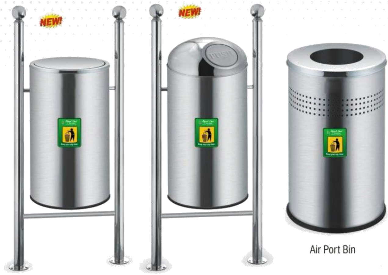
Air Port Bin