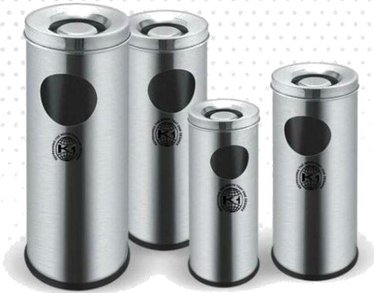
Ash 'n' Trash Bins