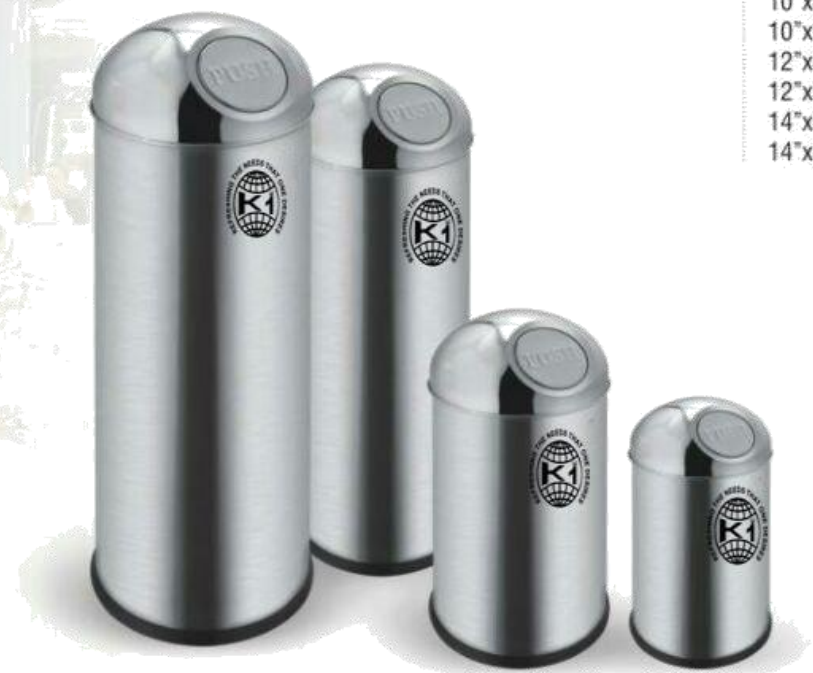
Push Can Bins